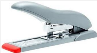
See Surgical Face Mask Poster